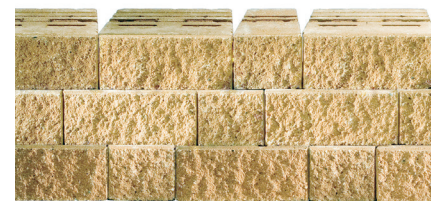
3-2 Standard-Cobble Ratio