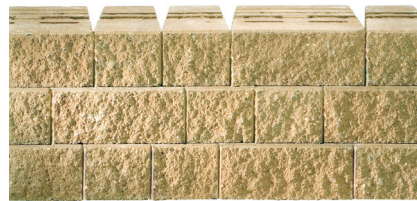
1-2 Standard-Cobble Ratio