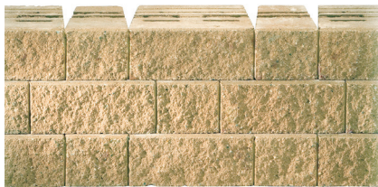
1-1 Standard-Cobble Ratio